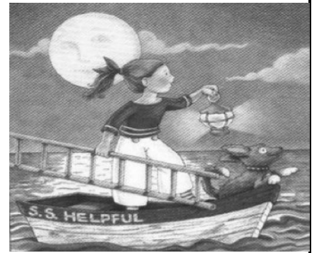
Mary En- gelbreit