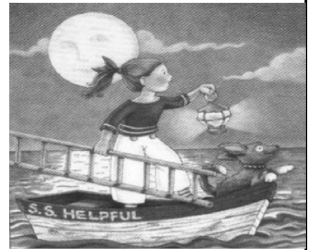
Mary En- gelbreit